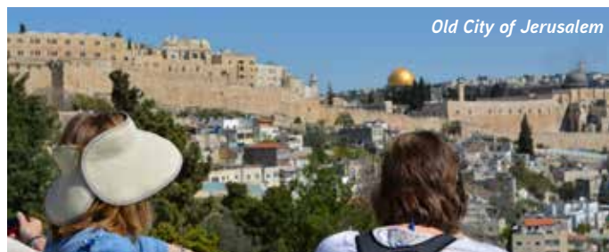
Old City of Jerusalem